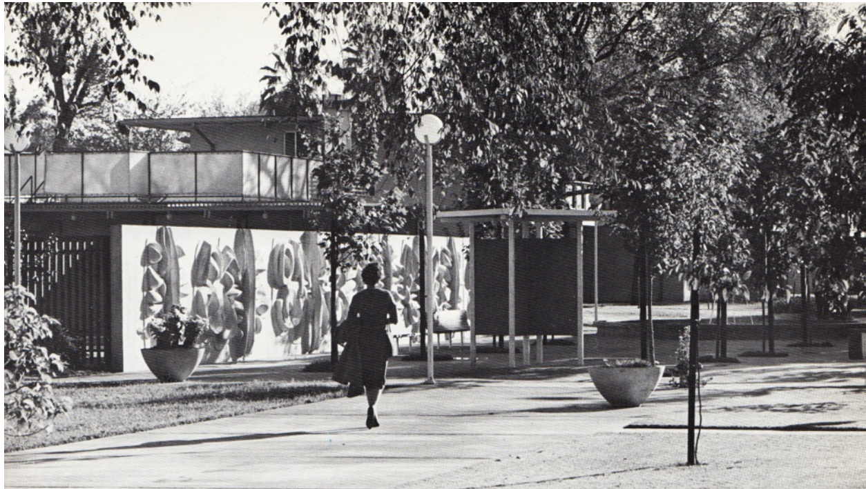
Seen here: sculptural wall "Untitled" by Jacques Overhoff.